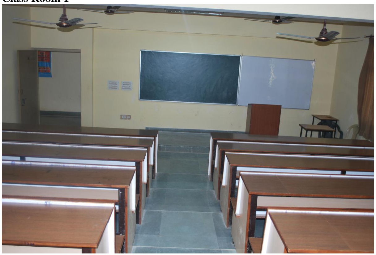
Class Room 2