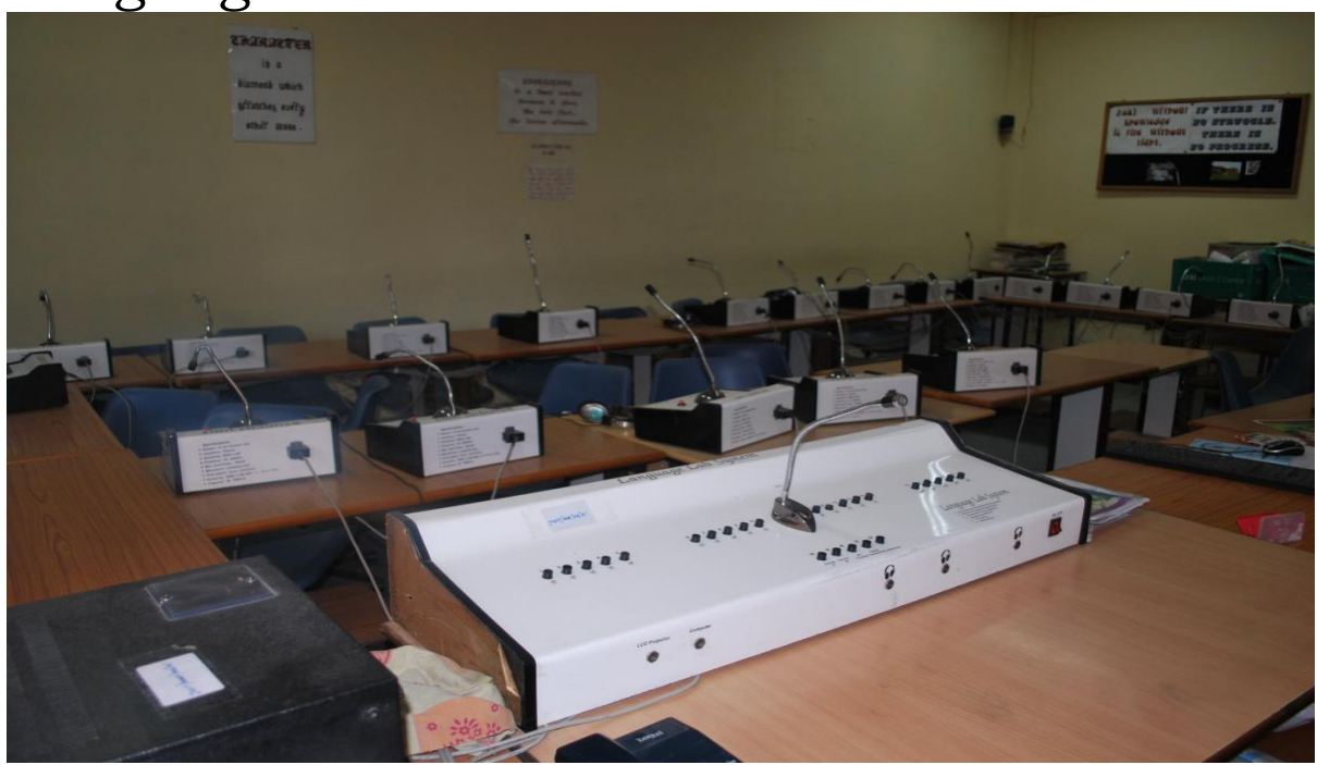
Electronics Communication Lab 1